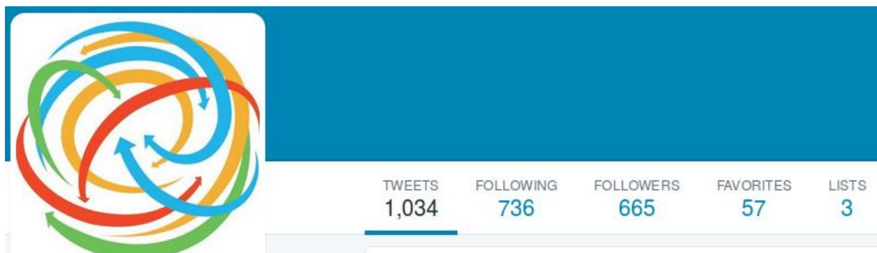
Figure 2: Twitter statistics October 2014

The Twitter account can be accessed here: https://twitter.com/BIG_FP7 , below are the statistics from October 2014